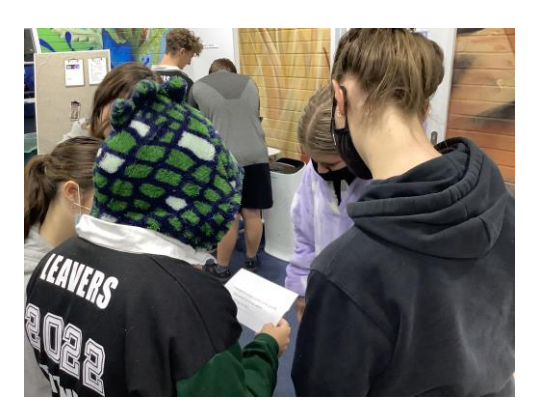
In-house treasure hunt

Please note that charges may apply to some activities. We do not seek to profit from these events and your child's participation in any activity requiring payment is at your discretion.