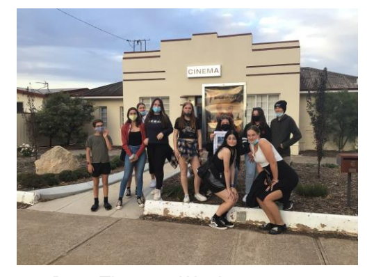
Betty Theatre - Wagin