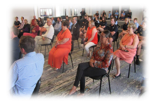
COVID restrictions limited attendance at the function.