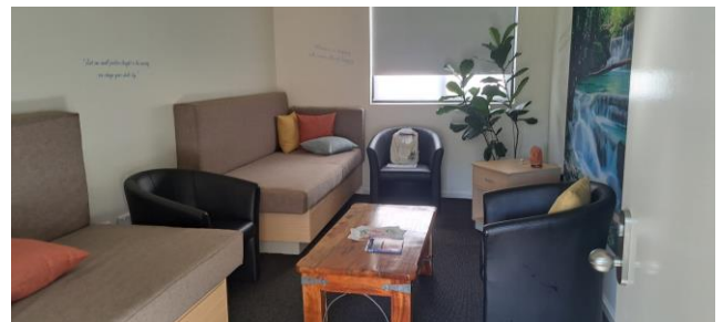
Chillout/Reset Room suggestion

The Reset room serves as a valuable resource for promoting mental health and overall wellbeing among our students.