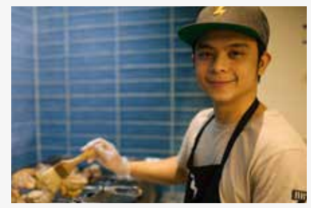
Get paid to work, while learning relevant on-the-job skills